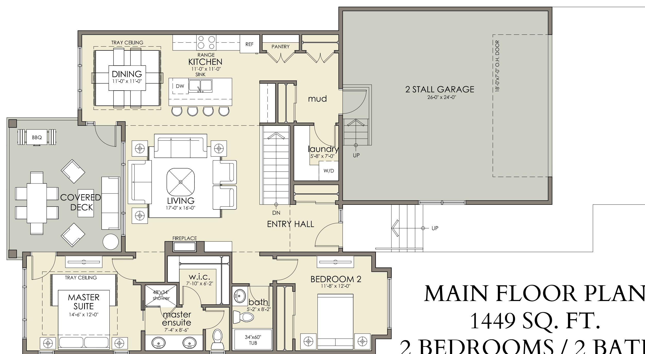
MAIN FLOOR PLAN 1449 SQ. FT. 2 BEDROOMS / 2 BATHS MAIN FLOOR LAUNDRY