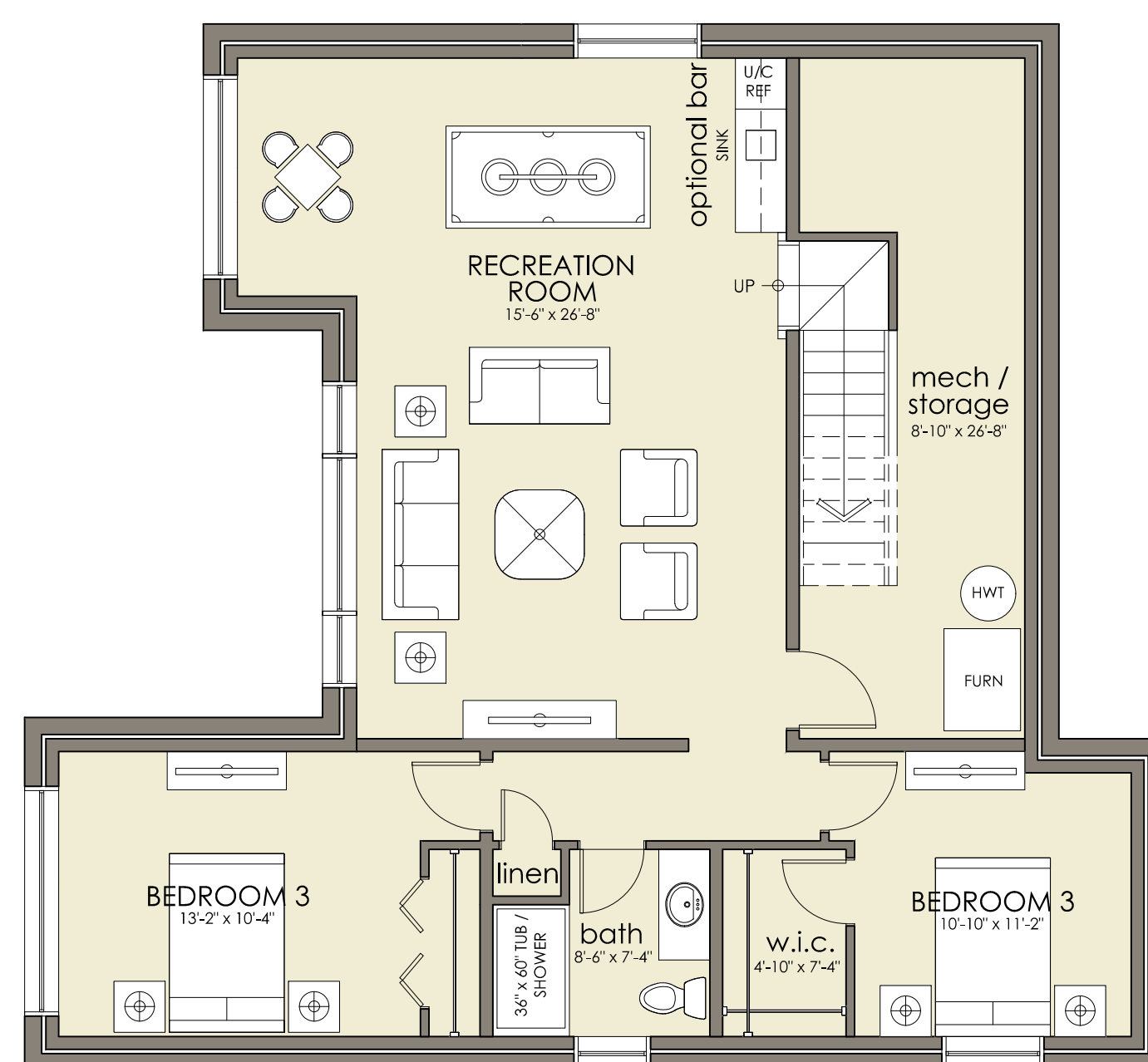
OPTIONAL FINISHED BASEMENT FLOOR PLAN 1311 SQ. FT. 2 BEDROOMS / 1 BATH

The developer reserves the right to modify the floor plans, architectural features and finishes without notice unless agreed upon in a purchase contract. All renderings, maps, plans and other images are provided to assist purchasers in visualizing the project and may not accurately represent the final product. Square footages and lot dimensions are calculated based on architectural measurements and lot plans and thus may differ from the actual surveyed unit areas, as set forth on the registration plan.